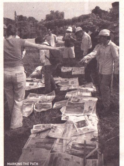
MARKING THE PATH