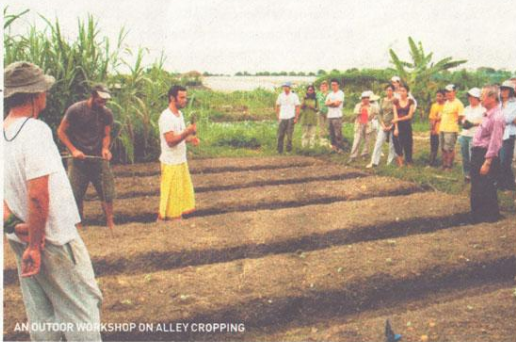
AN OUTDOOR WORKSHOP ON ALLEY CROPPING