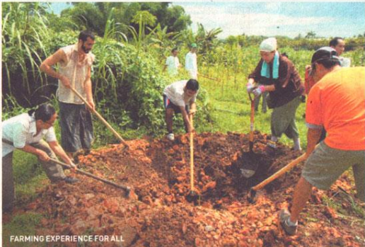
FARMING EXPERIENCE FOR ALL